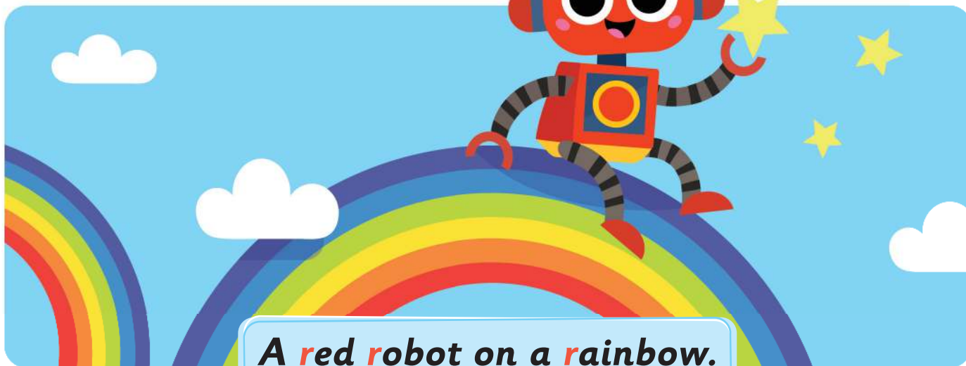
A red robot on a rainbow.