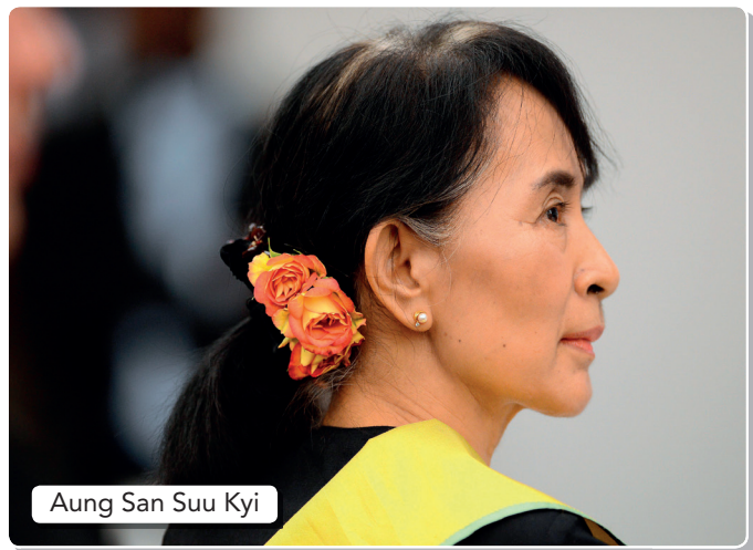
Aung San Suu Kyi

5 Complete the questions about the subject (a) and about the object (b) of each sentence.